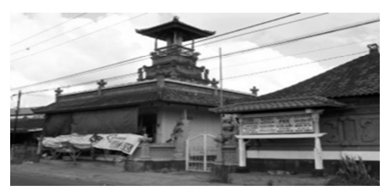
Figure 02. Bale banjar which has expanded functions

Adhika (2015: 65) states that several Bale Banjars in Denpasar City have developed into other functions, such as a large number of wholesalers 'activities (wholesalers), fruit markets, shops, and doctors' practices. Banjar Titih, Tegal banjar, Banjar Satriya, Grenceng banjar are examples of the many Bale Banjars that are used by traders to sell, including large parking lots like the Banjar Kedaton when certain events such as the Bali Arts Party (PKB).