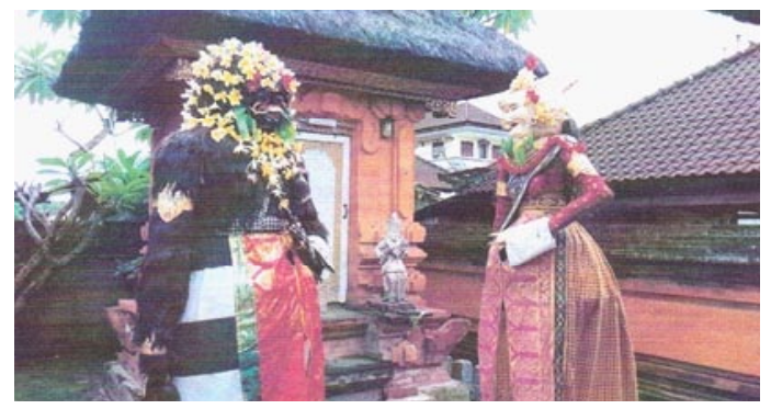
Figure 1. A Balinese figure with a large, black identity, long teeth and poleng cloth