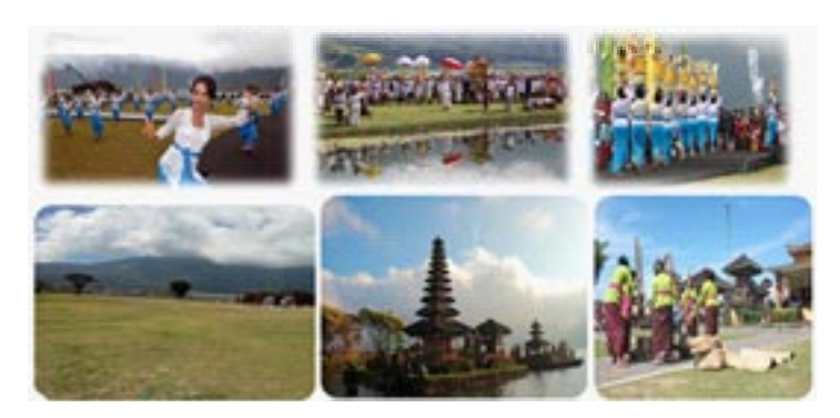
a.The Dance of Rejang renteng, b. Melasti, c Nyuun gebogan, d. Development of Yoga location, e. Pura Ulun Danu Beratan, f. Ngoncang

By encyclopedic meaning, those are the potentials owned by Desa Candikuning, District of Tabanan that could be expanded through inovations in order to have significant impact on the society as well as a strategic effort of one of the important soko in supporting regional economy.