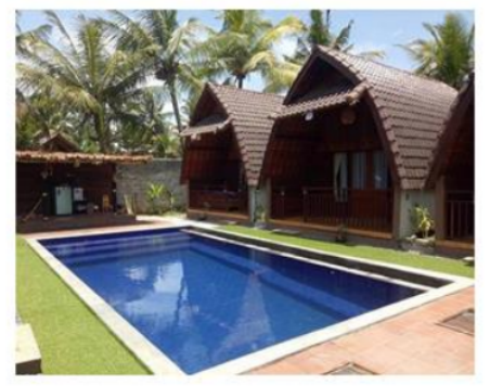
Photo 2. Tourism Support Facilities at Tegallinggah Custom Village