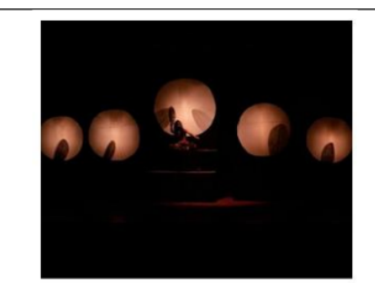
Photo 3. Art Attraction at Tegallinggah Custom Village

Photo 2. Tourism Support Facilities at Tegallinggah Custom Village