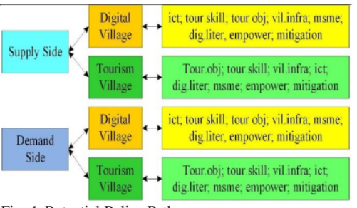
Fig. 4. Potential Policy Path

The overall results of the MULTIPOL analysis can be presented in the form of a potential policy path as shown in Figure 4.