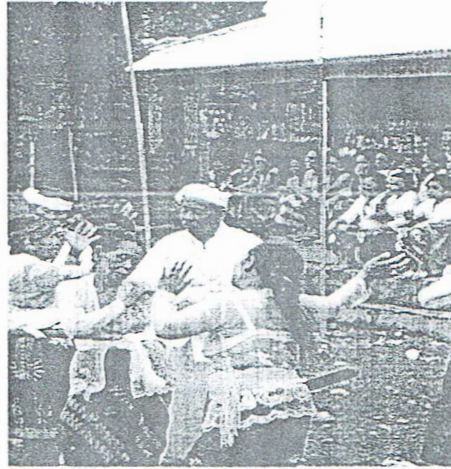
Balian Desa that was a woman, has replaced her position by Pamangku of men after the influence of Hinduism