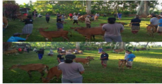
Fig. 2. "Maedeng Godel" for the selection process.

When viewed from etymology, 'Maedeng Godel' consists of two words eng maedeng 'with the word 'edeng'(BB), the prefix 'ma 'means to see, to show, while 'godel' is a calf. Therefore, maedeng godel is a tradition practiced by the community of Susut-Buahan Village nearing (two weeks) 'tawur kasanga' brawl which is the tradition of welcoming the arrival of the Nyepi holiday every year as a change of çaka year for Hindus. There are hundreds of godels shown as an exhibition on the local setra (grave) page to be selected in order to get a pair of godel (male and female) which can really be used as a means of upakara (caru / kurban) the day before Nyepi day during the 'tawur kasanga'. Godel male is dedicated to the means of upakara on "Catus Pata" (the Great Crossing), while the female Godel is dedicated to upakara facilities at Pura Dalem. The tradition of 'maedeng godel' is routinely held every year as an obligation by the community of Desa Susut-Buahan can be seen as one of the following pictures / photos.