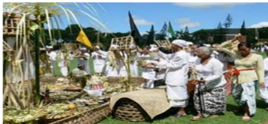
Fig. 3. "Macaru" activities on "Catus Pata".

Based on the ejection, Bhatara Dalem in this case was placed as part of the Siwaistic concept. This is in line with the concept of Tri Kahyangan in Bali. Lord Brahma at Pura Desa, Dewa Wisnu at Puseh Temple, and Dewa Shiva at Pura Dalem. Meanwhile, the intersection fits the concept of the Five Gods namely; in the north of Lord Vishnu, east of Lord Iswara, in the south of the god Brahma, in the west of the god Mahadewa, and in the center of Lord Shiva. Therefore, the intersection is usually made with a statue of "Catur Mukha". In addition, the intersection is a place of redemption ritual with the concept of "Bhuwana Chess". One of the activities of 'macaru'di 'catus pata 'is as shown below.