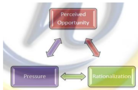
Figure 1. Causes of Fraud

[10] states fraud as a misinterpretation of the truth or concealment of material facts that causes a person to act adversely to another party. Fraud can occur either individually or in groups. This behavior can occur due to pressure, chance, and rationality. [11] describes the three causes in a chart shown in Figure 1, as follows: