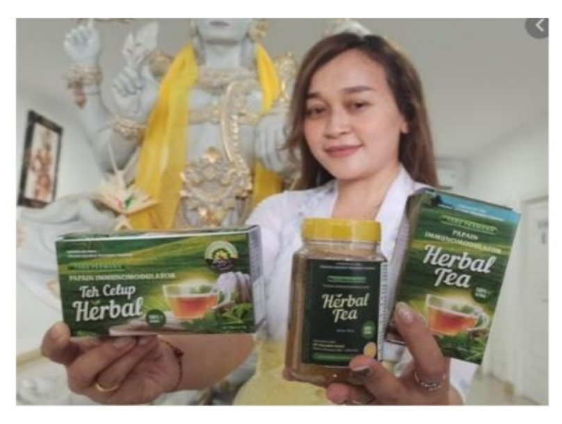
Figure 6 Herbal Products Sample Incubation Business UNHI Denpasar Alumni

In line with Bali potential area as a center for Indonesian cultural tourism, the vision and mission of UNHI Denpasar Incubator Business was to become a technology-driven entrepreneur and local wisdom in Bali. Furthermore, the tenant process (service users) who have been given training, mentoring was a 'startup' that developed business based on local wisdom. Products produced include Ayurweda herbal products, percussion and traditional Balinese culture, bridal makeup specifically adheres to literature, and bebantenan (offerings) that refered to literature and still prioritized the needs of the community (Rhismawati, 2018). Besides the general public and alumni, UNHI Denpasar Incubation Business training is prioritized for UNHI students as a testimony from the following student.