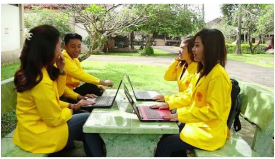
Figure 2 UNHI Denpasar students can follow campus activities through websites

news from analog format to digital format so that it was easier to produce, stored, managed and distributed. The digitalized information can be presented in the form of text, numbers, audio, visuals, which contain ideology, social, health and business. In the current e-library pilot stage, the Denpasar UNHI library seek to make various digital library collections and photocopying functions. Some of the equipment needed to digitalizing include: computers, operators, scanners, and of course the appropriate software to carry out this activity. The printed document that is transferred to digital form would require an application, namely Adobe Acrobat (Pdf) or Omnipage. Furthermore, for audio documents to be moved or transferred to digital, an application called JetAudio or CoolEdit or another application that had the same function must be used (Utomo, 2019).