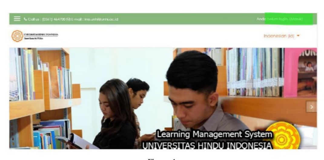
Figure 1 E-library Development to support Conventional Libraries.

Second , UNHI Denpasar also continued to improve its accreditation achievements. Until the 2020 school year, UNHI Denpasar has achieved B accreditation, while several faculties have been able to achieve A accreditation, including the Economics Faculty and the Usadha Faculty. This accreditation achievement is related to the competencies of educators (lecturers) who have successfully conducted research (research) and strategic steps in dealing with future trends (future strategies). Competence in building networks to grow knowledge, research direction, and skilled in getting international grants. Educators must integrate research results into student teaching materials. They also need to have the competence to predict precisely what will happen in the future and its strategy. Educators must also have the competence to predict precisely what will happen in the future and its strategy, by means of joint-lectures, joint-research, joint-resources, staff mobility and rotation, understanding the direction of SDG's, and so forth.